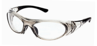
Frost Frame/Clear Lens • 1651801